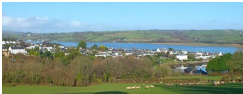
Landulph and the River Tamar